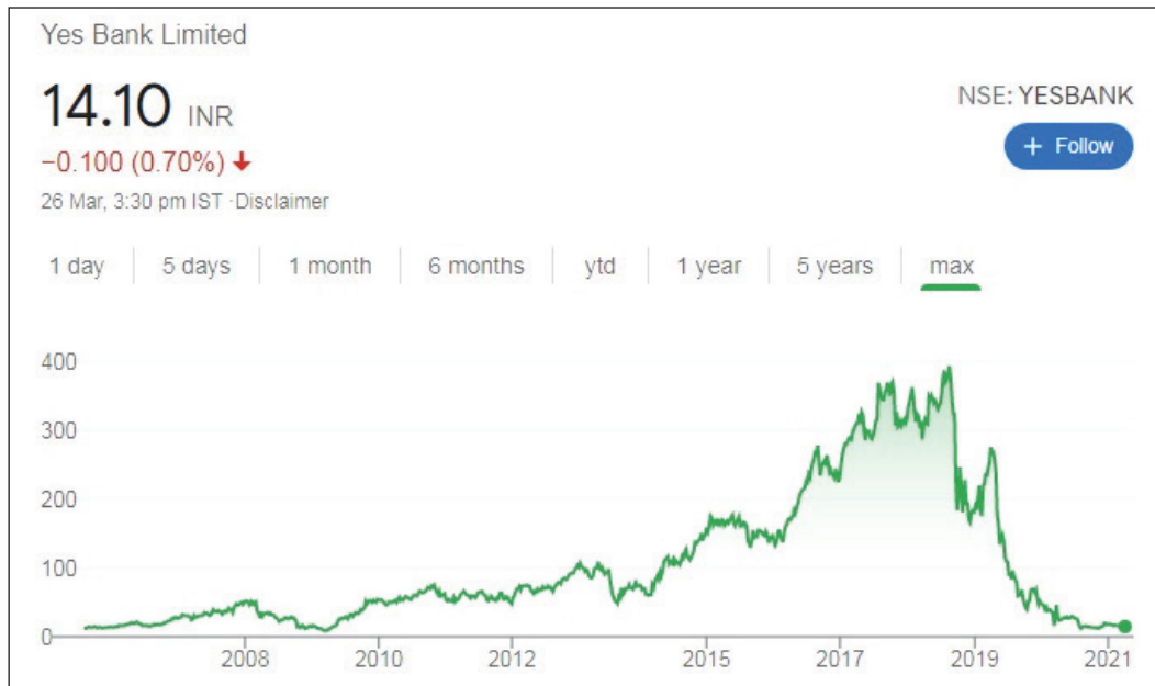
Figure 1. Share Price Status of YES Bank from 2008 to 2021.