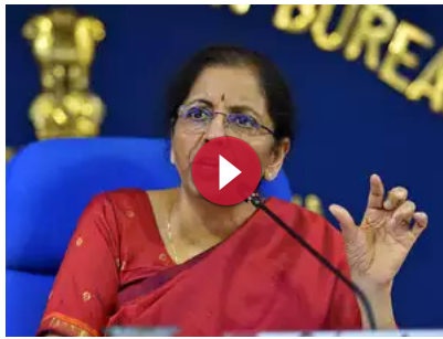
Cabinet approves Yes Bank reconstruction plan as proposed by RBI: Nirmala Sitharaman

While announcing it, Finance Minister Nirmala Sitharaman said that the scheme's aim is to safeguard depositors and ensure the stability of the financial system. She also said that SBI will have a lock-in period of three years for only 26% of its stake in Yes Bank. For other likely investors, the lock-in period would be 75 per cent till three years.