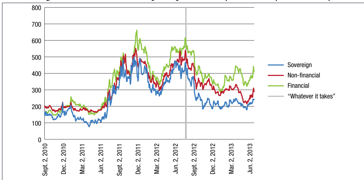
Figure 2a: Credit default swap risk premia on 5 year bonds by sector – Italy

The programme was thus successful because it addressed a fundamental problem of the monetary union. Countries in the eurozone do not have direct influence on monetary policy, but issue debt in euros. This constellation resembles a situation