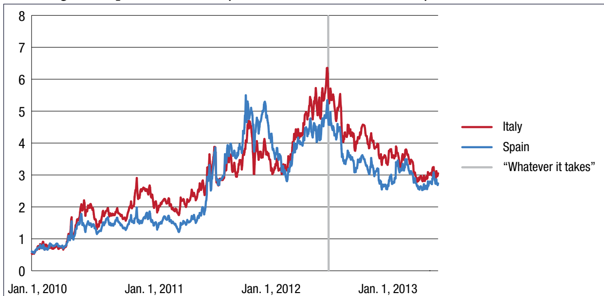
Figure 1: Spreads (%) on 10 year bonds relative to Germany (1.1.2010–9.7.2013)

The bad equilibrium is one in which doubts about the solvency of a government lead to a self-fulfilling crisis. Once investors start losing trust in the