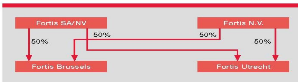
Figure 1: Fortis Parent Structure

Source: Fortis Governance Statement, English Version, January 2008, 9.