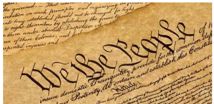
THE SUPREME COURT