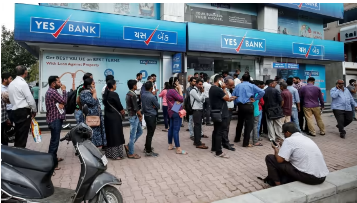
Analysts warn that Yes Bank customers might withdraw their money when restrictions are lifted on Wednesday

Uncertainty over lender's future deepens worries about coronavirus effect on economy