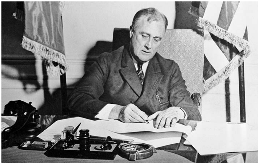
President Franklin Roosevelt signing the Emergency Banking Act

Signed by President Franklin D. Roosevelt on March 9, 1933, the legislation was aimed at restoring public confidence in the nation's financial system after a weeklong bank holiday.