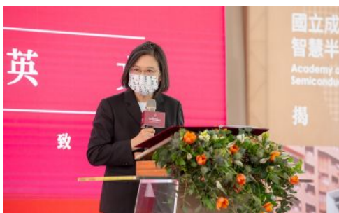
Tsai reaffirms commitment to Taiwan's semiconductor industry