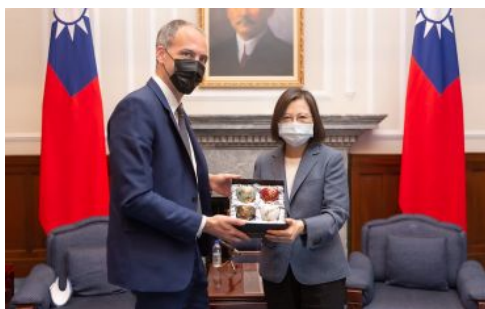
Tsai receives European Parliament's INGE delegation