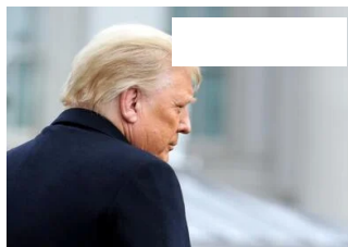
Trump revives threat to veto defense bill, teeing up battle with...