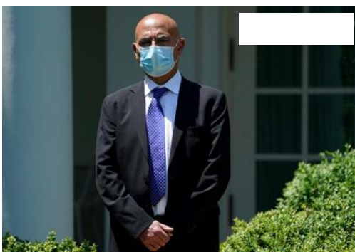
U.S. expects to have immunized 100 million against COVID-19 by the...