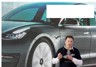
Tesla teams to visit Indonesia to check on investment in EV...