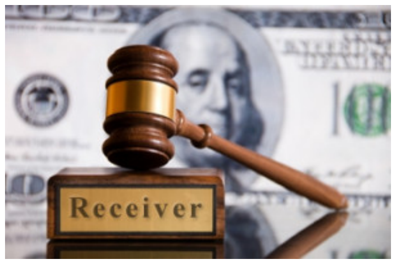
Fine-Tuning AMCONs Special Powers

The amended Act expressly provided for vesting legal title to acquired EBAs and in collateral securing such acquired EBA, and vesting power of sale, possession, management etc., in AMCON to exclusion of all other creditors notwithstanding that only equitable security exists in such collateral- Section 34 (1) (a) and (4).