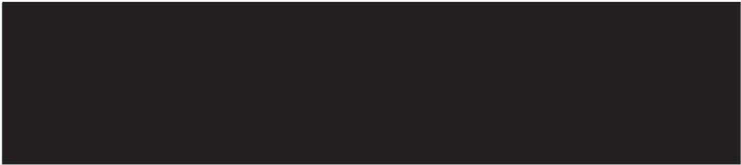
EXHIBIT A INVESTMENT GUIDELINES